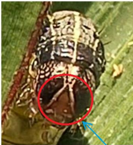
Inverted "Y-shaped" whitish suture on the front part of the head

4 dots arranged in the form of a trapezium on the other abdominal segments