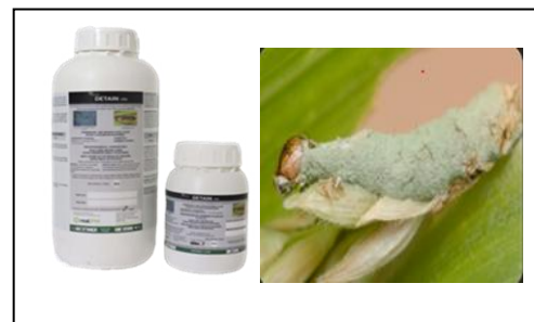
Fig 3, Mankhwala a Detain komanso mbozi yafufa.