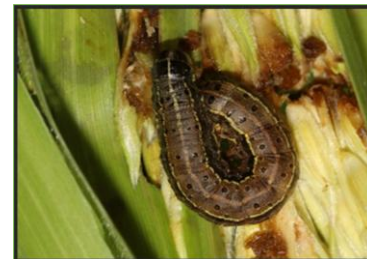
Fig 1, Mbozi Yofanana ndi Ntchembere Zandonda ikuwononga Chimanga